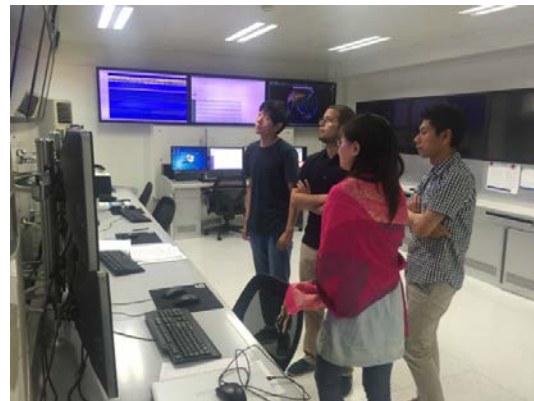
Visiting of tsunami warning operation room