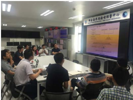
Research presentation and exchange