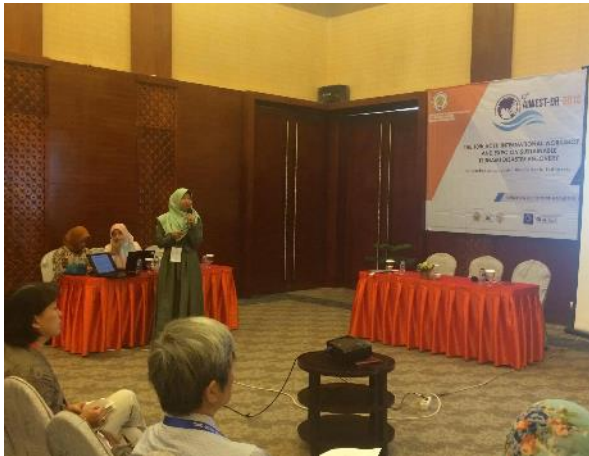
Dyshelly presented the paper