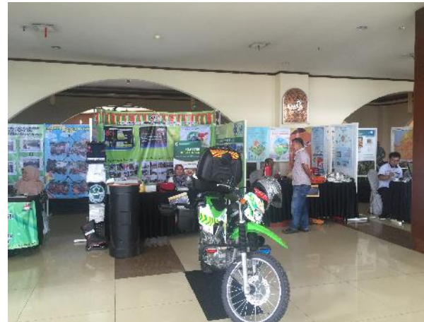
One of booths in the expo about Provincial Health Crisis Center