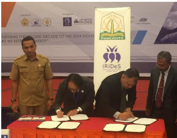
MoU signing between IRIDeS and TDMRC Syiah Kuala University