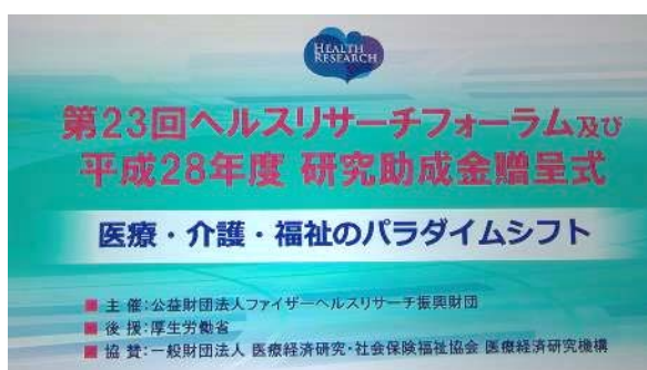
Awarding ceremony after the Forum