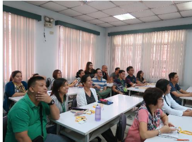
Researchers in San Lazaro Hospital actively participating the lecture using answer pad system