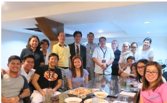
Together with surgical and emergency medicine residents and faculties in UP Manila