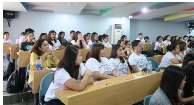
Students of nursing school, public health nurses, teachers and faculties of Angeles University actively participates using answer pad system