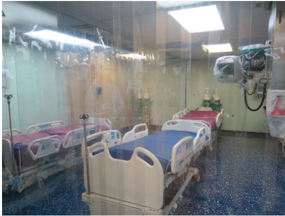
One of the four ICU rooms are isolation room for infectious disease.