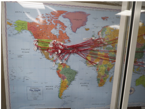
The Comfort Missions.