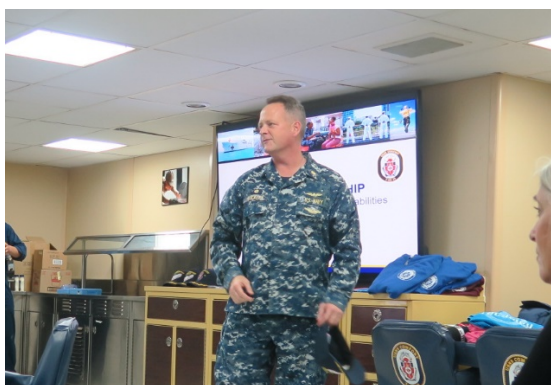
Captain explains the hospital ship and the on-going mission.