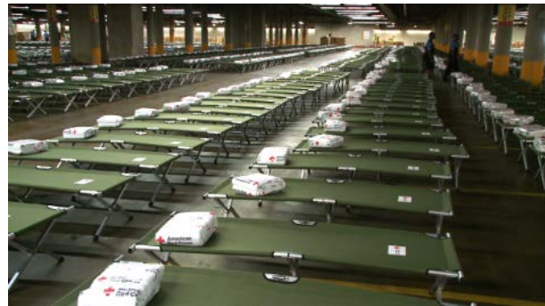
Dallas Convention Center in preparation of 5000 beds for the affected people in Hurricane Harvey.