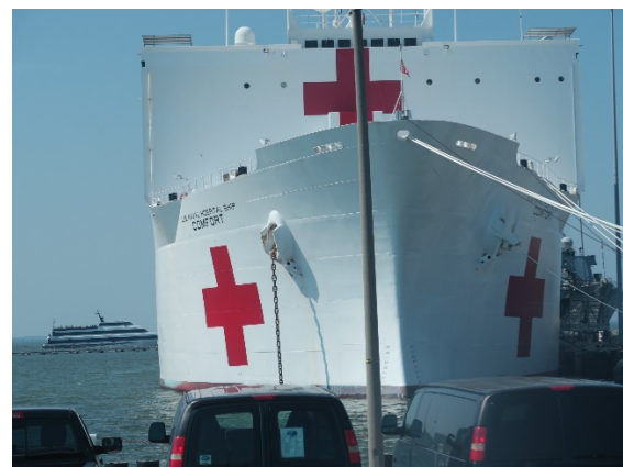
Hospital Ship Comfort is in preparation for deployment to Puerto Rico