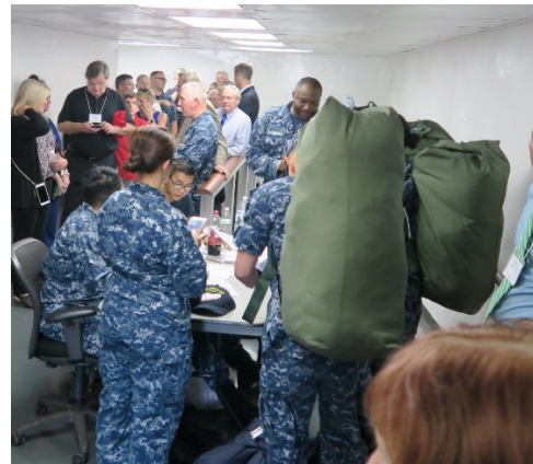
Young soldiers checking into the Ship.