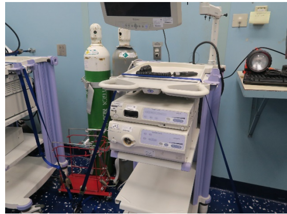
Multiple equipment for laparoscopic and general surgeries are provided and fixed to the floor. The sterilization is always available to continuously provide surgical care.