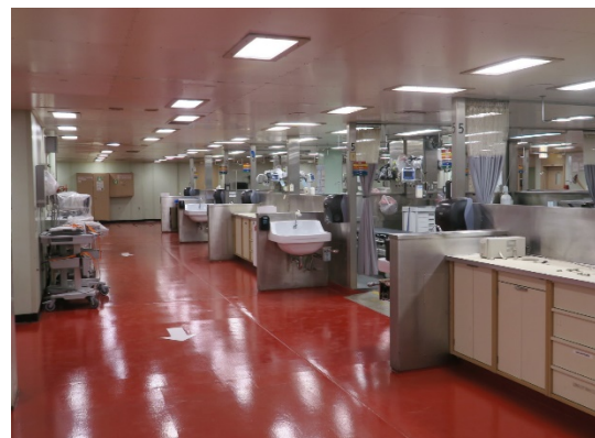
Admission Room for the patients. Every items are fixed to the floor and the bumps to avoid bloods to spread on the floor