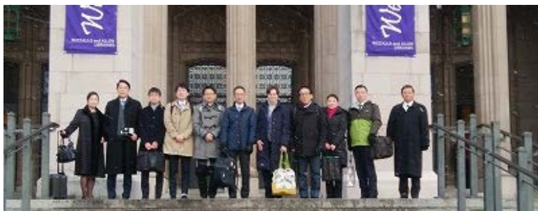
Symposium participants from Japan