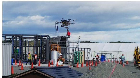
A drone with robotic arm brings the emergency tourniquets in a red bag.