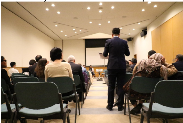
Questions from the floor – seeking for a successful community relocation case