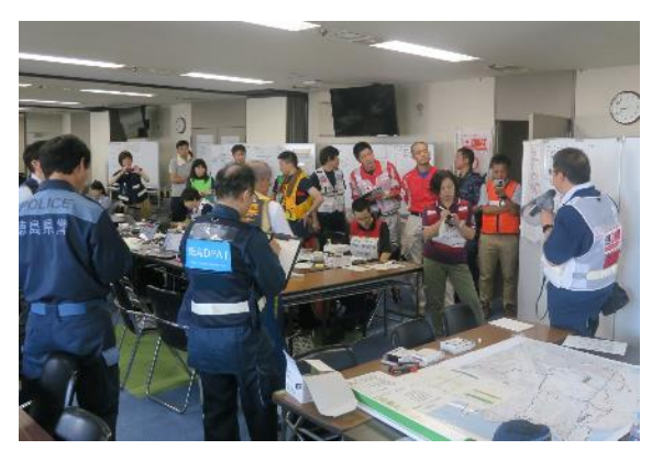
There were HQ meetings in every two hours to share the latest information and to adjust the operations.