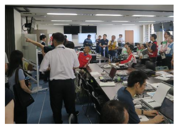
There were islands of tables for Liaisons and Stakeholders.