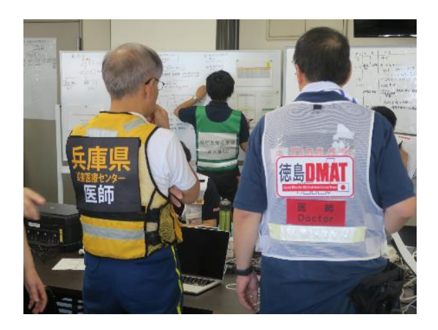
Tokushima DMAT Chief medical doctor of HQ and advisory Hyogo DMAT