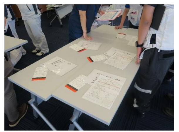
Simulated information of severely ill patients (Red Tagged) in Yoshinogawa Medical Center. Local and assisting DMATs are discussing the plan.