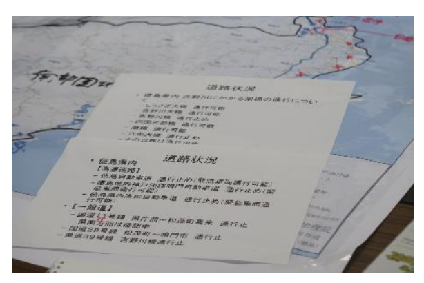
Map of Tokushima Prefecture and the road availability information on the desk