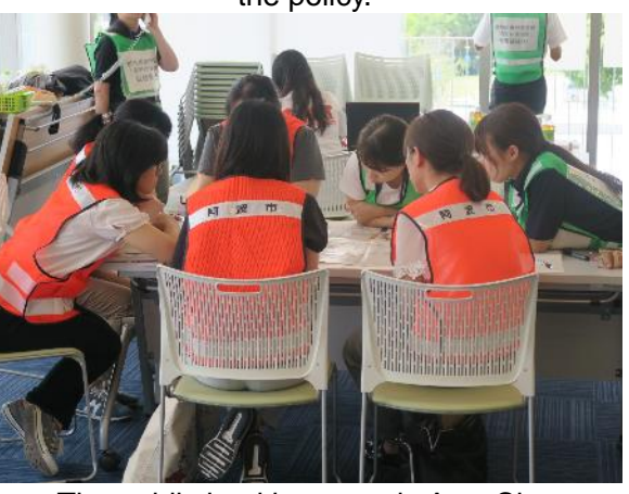
The public health nurses in Awa City, Yoshinogawa City and Yoshinogawa Health Office are discussing how to manage the health issues in evacuation centers.