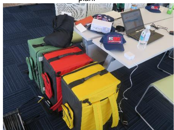
Assisting DMATs bring in the standardized medical materials for Green, Yellow and Red triage areas.