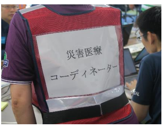
Disaster Medical Coordinator in Tokushima Prefecture coordinating various Liaisons and Stakeholders