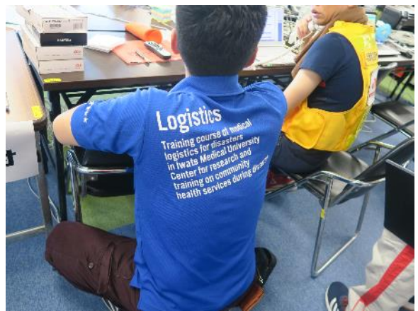
Logistic teams from national DMAT are controlling and supporting the drill in HQ