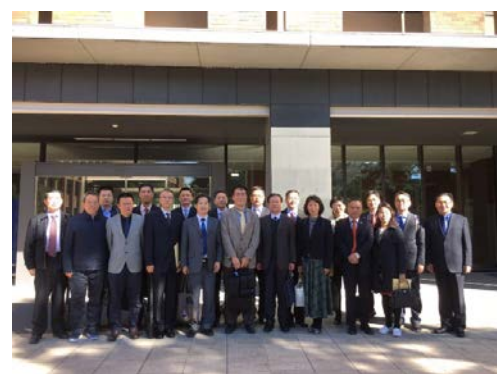
Guangdong Health Emergency Medical Team