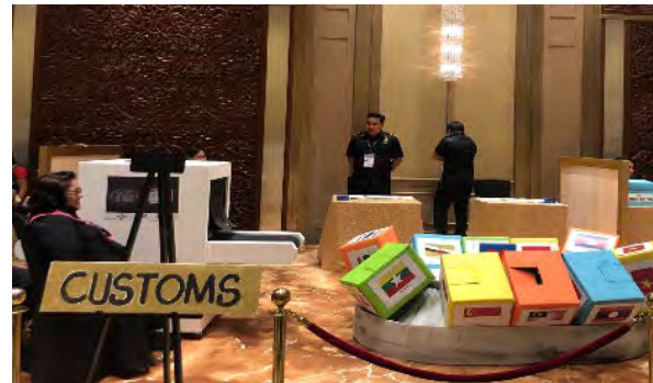
Realistic simulation of entrance. Immigration, Customs and registration to the national authorities.