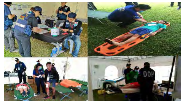
Patient care simulation