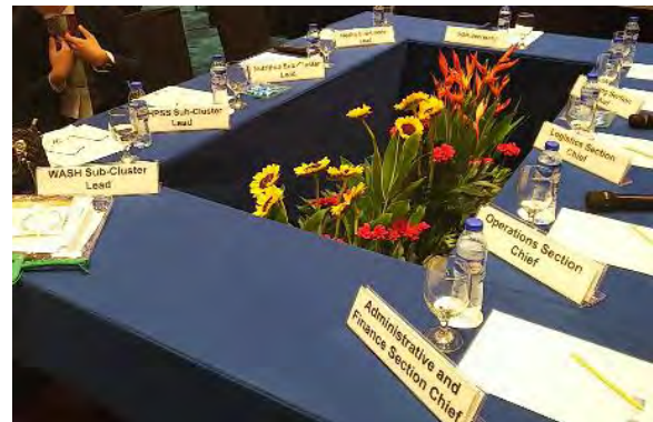
Health Cluster Meeting consisting of Department of Health, WASH, Nutrition, Financial and other sectors.