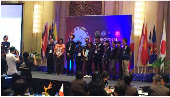
Team appreciation: JDR from Japan.