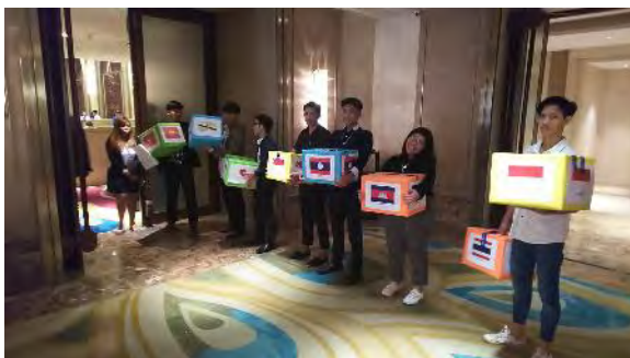
Suitcase box containing the documents and stress injection for the exit.