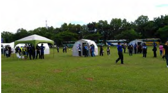
Field drill at the Philippine Army Ground