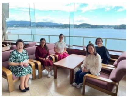
Interview with the owner of the Minami Sanriku Hotel Kanyo