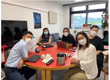
Collaborative research meeting with UCL IRDR Centre for Gender and Disaster Research and IRIDeS researchers