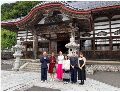
Visiting Kishoji Temple in Kirikiri