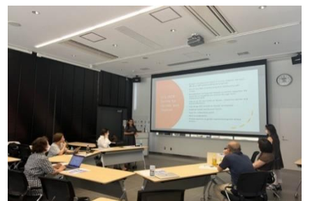
The first UCL IRDR Centre for Gender and Disaster Research and IRIDeS workshop held at the IRIDeS