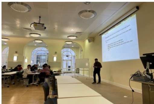
Lecture of UCL IRDR