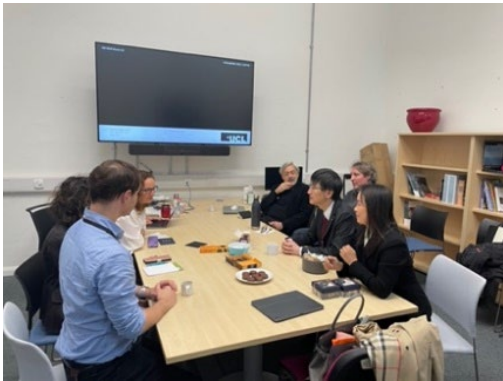
UCL IRDR meeting