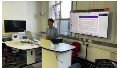
Invited presentation at University of Bristol