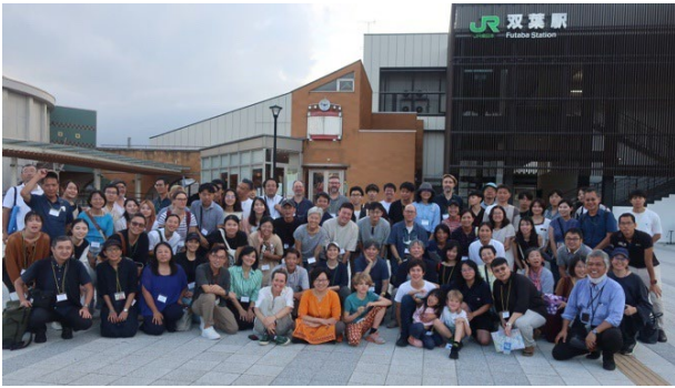
Large group photo of all participants on Sept. 16 in Futaba Town