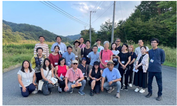
Small group participants who visited Tsushima area of Namie Town, on Sept. 17