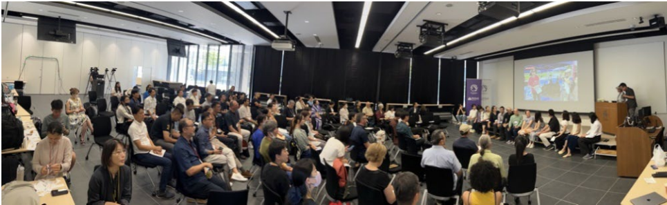
Big Table Gathering on the morning of Sept 18, sharing their field visit experiences