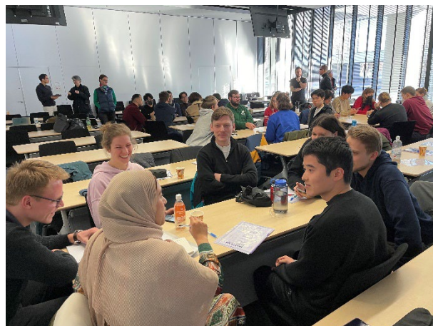
Group work impressions