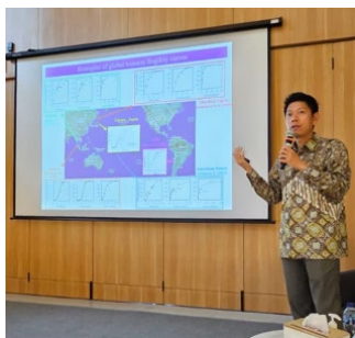
The 1 st lecture on resilience of coastal communities in Indonesia

SATREPS (JST-JICA) Building Sustainable System for Resilience and Innovation in Coastal Community: https://www.coast.dpri.kyoto-u.ac.jp/satreps_bricc/