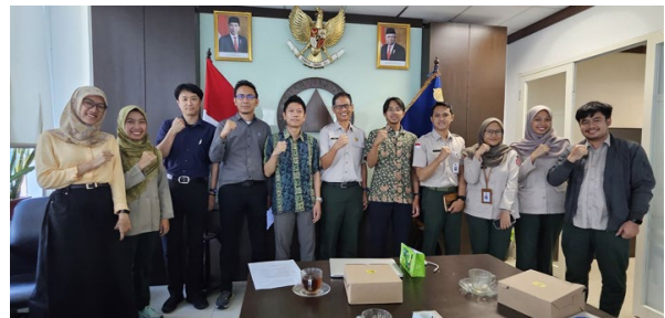
Discussion at the National Agency for Disaster Countermeasure (BNPB)