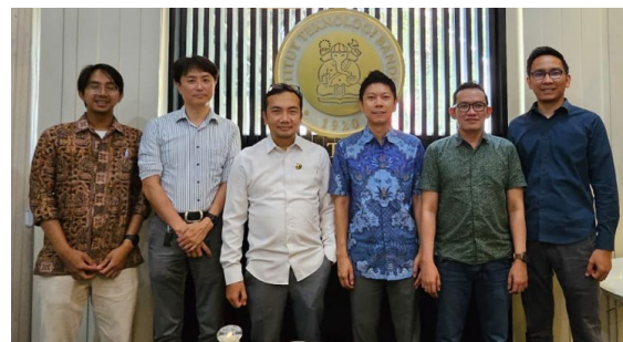
Discussions with the vice dean of Civil Engineering Department and other TU alumni