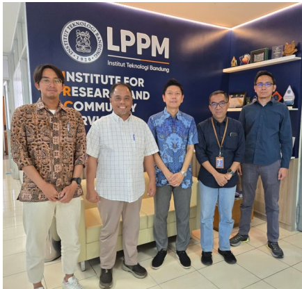
Discussions with dean of Industrial and Technology Faculty and director of Institute for Research and Community Service