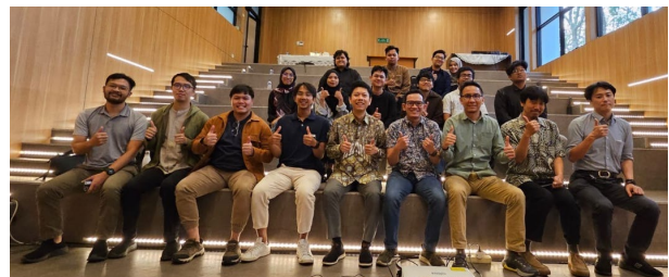
Participants of the 1 st lecture