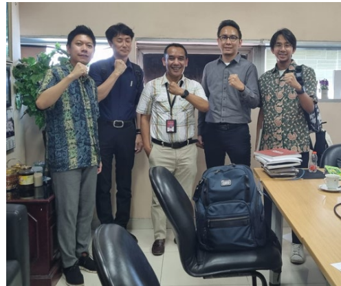
Discussions at the Ministry of Housing Affairs (KEMENDAGRI)