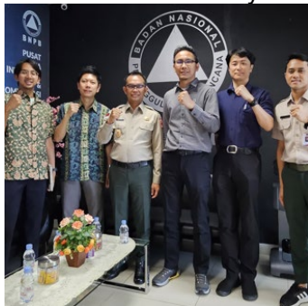
Discussion at the National Agency for Disaster Countermeasure (BNPB)