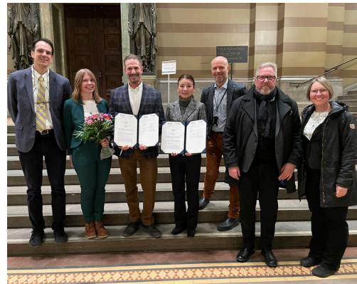
The MoU signing between CNDS and IRIDeS