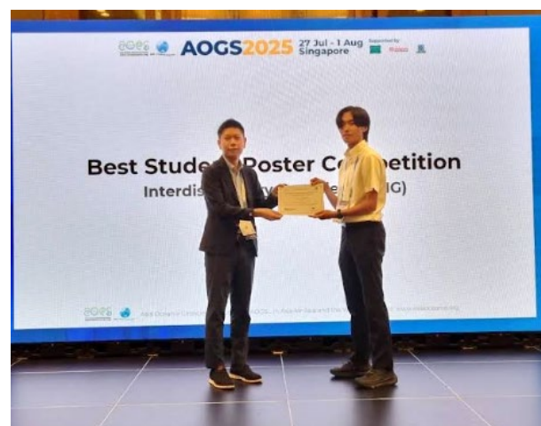
IRIDeS student receiving best poster award