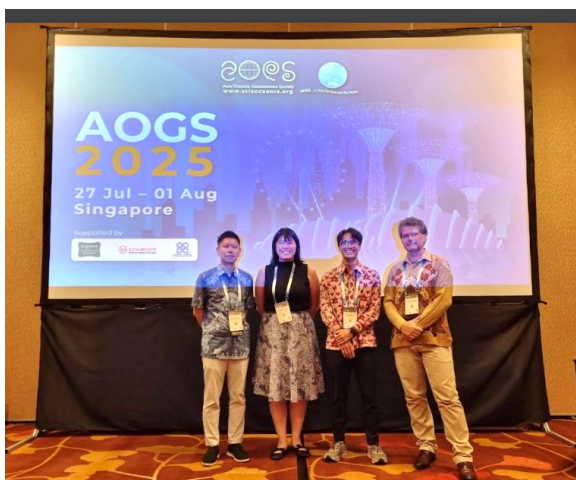
A session organized by IRIDeS’s members