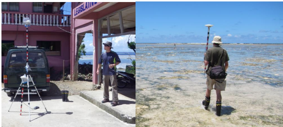
Differential GPS base station at Hernani town hall (left) and rover surveying the coral reef in Guiuan (right).

During post-processing, the topographic and bathymetric data were referenced to mean sea level based on the TPXO global tidal inverse solution. The Digital Elevation Model (DEM) created for each town is being used as the domain for 1-dimensional and 2-dimensional wave models to understand how waves caused such devastation in these towns. Results of these simulations can be seen on the laboratory's website at http://hydraulic.lab.irides.tohoku.ac.jp/app-def/S-102/2014/?page_id=54 and http://hydraulic.lab.irides.tohoku.ac.jp/app-def/S-102/2014/?page_id=268 .