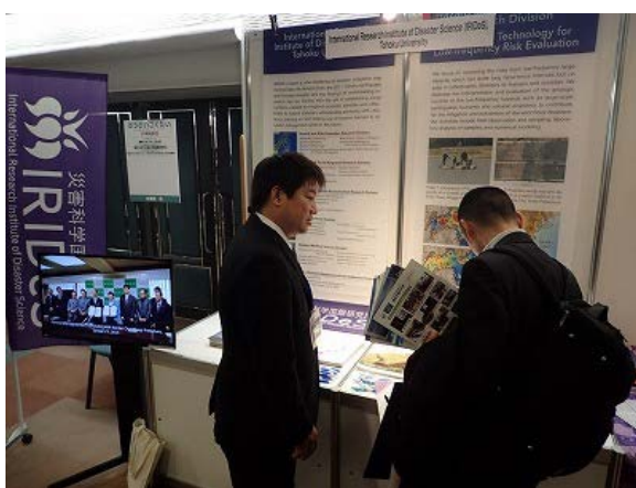
IRIDeS Booth (3)