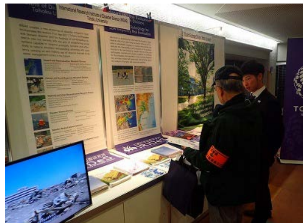
IRIDeS Booth (4)