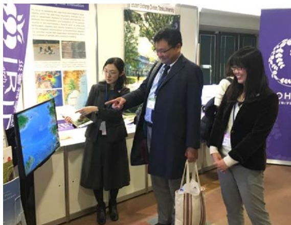
IRIDeS Booth (1)